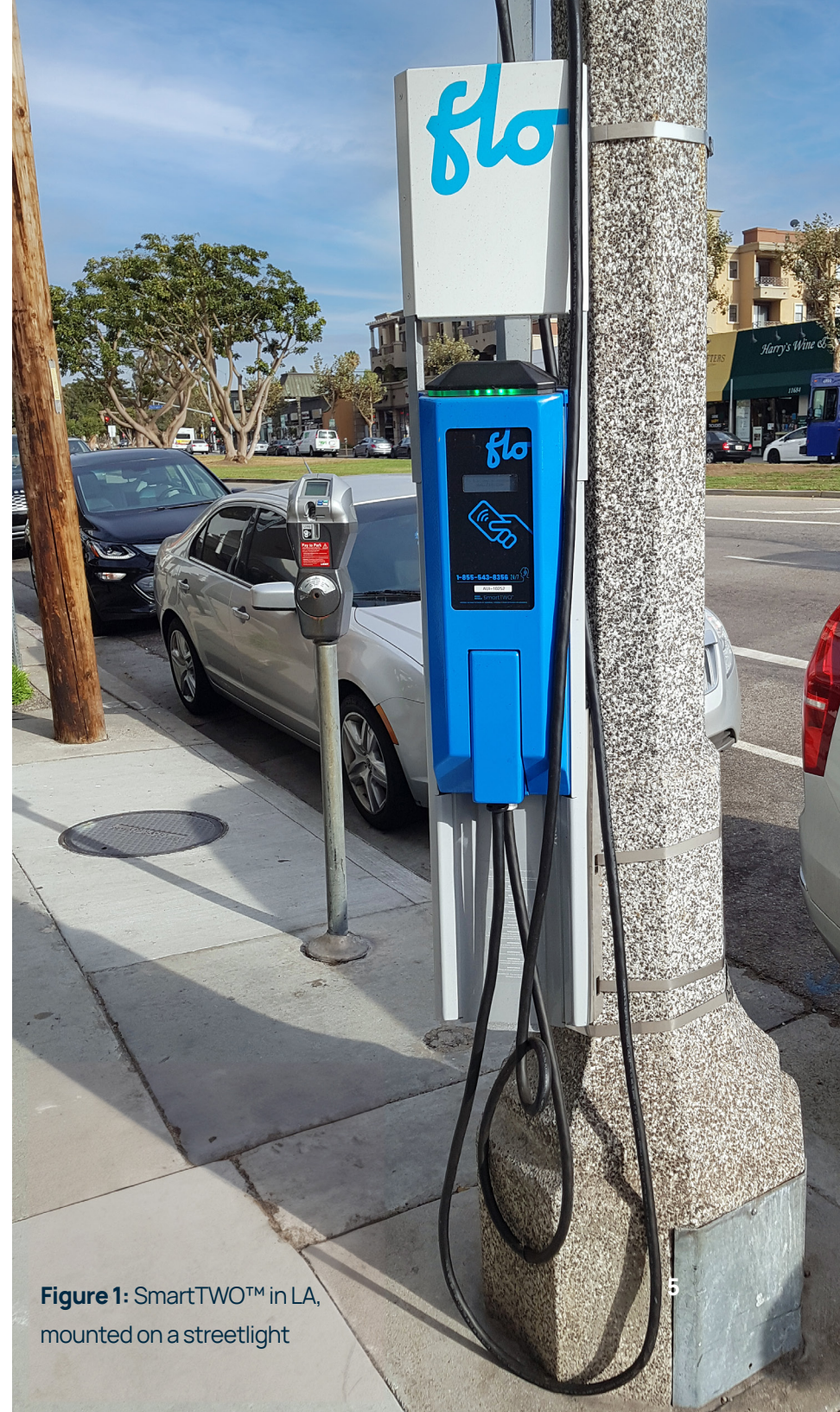
Figure 1: SmartTWO™ in LA, mounted on a streetlight

Deploying the chargers quickly was a priority for the city of Los Angeles, and as such the timeline for deployment on this project was condensed. After the initial project approval in August of 2018, a small pilot project was initiated in November of 2018.