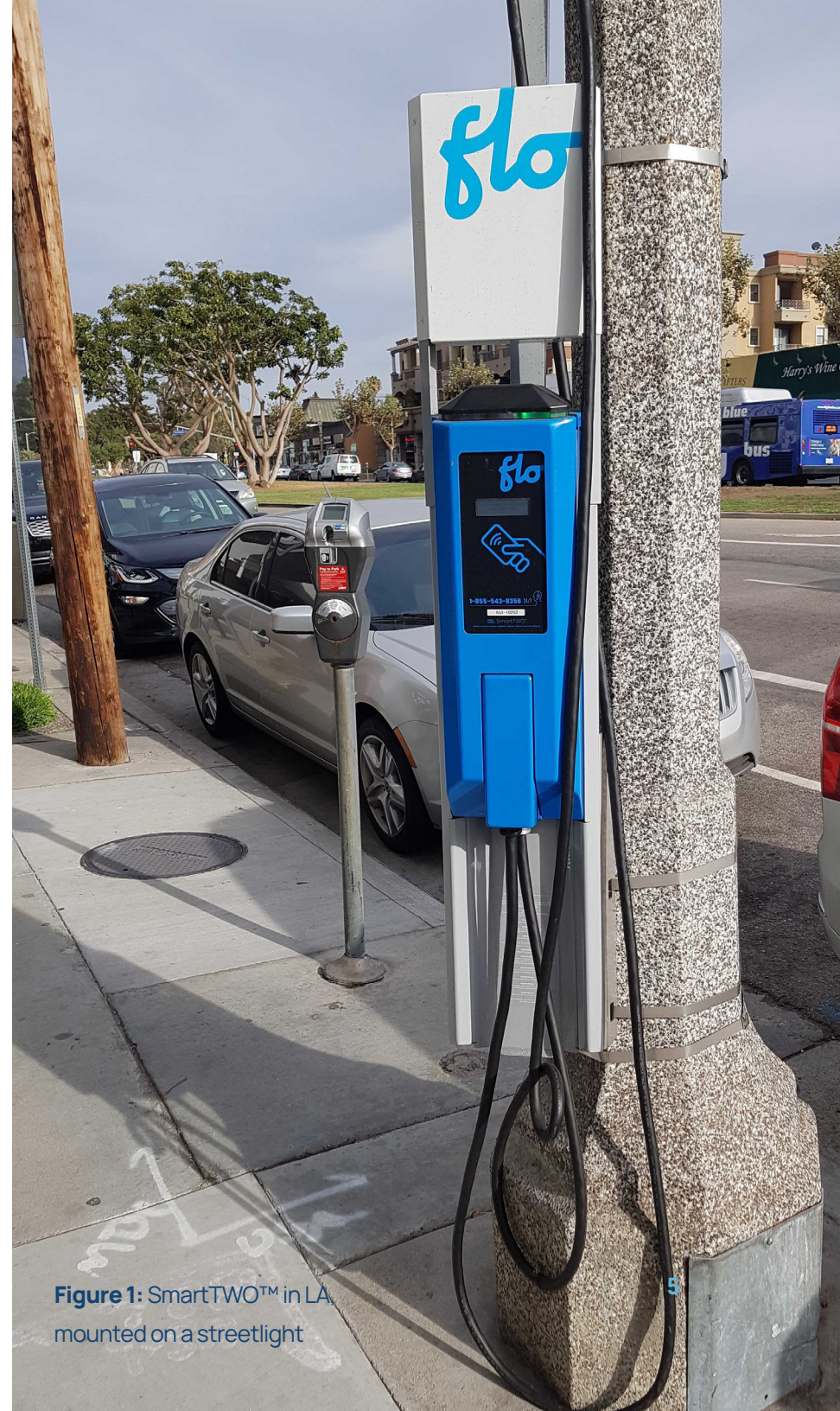
Figure 1: SmartTWO™ in LA, mounted on a streetlight